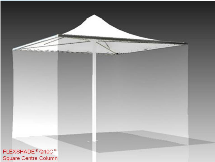
FLEXSHADE® Q10C™ Square Centre Column